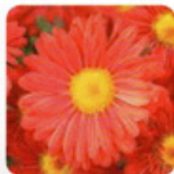
Dark Bronze Daisy