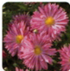
Dark Pink Daisy