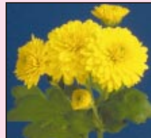
SESQUI CENTENNIAL SUN

YELLOW DAISYMUM Fine yellow single with gold center. A must with the Daisywhite. September 15